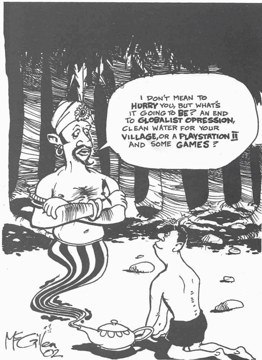
Figure 28.5 "I Don't Mean to Hurry You."