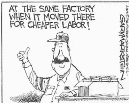
Figure 28.1 "As an Illegal Immigrant."