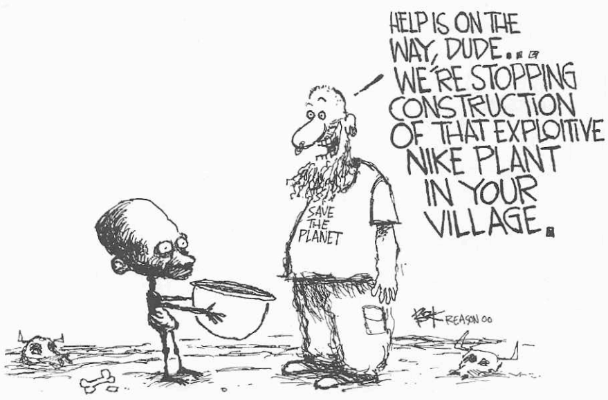
Figure 28.2 "Help Is on the Way, Dude."

Source: By permission of Chip Bok and Creators Syndicate, Inc.