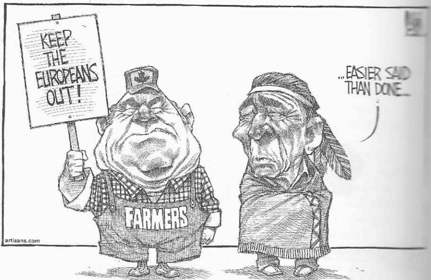
Figure 28.4 "Keep the Europeans Out."

Source: Patrick Chappatte/Globe Cartoon.