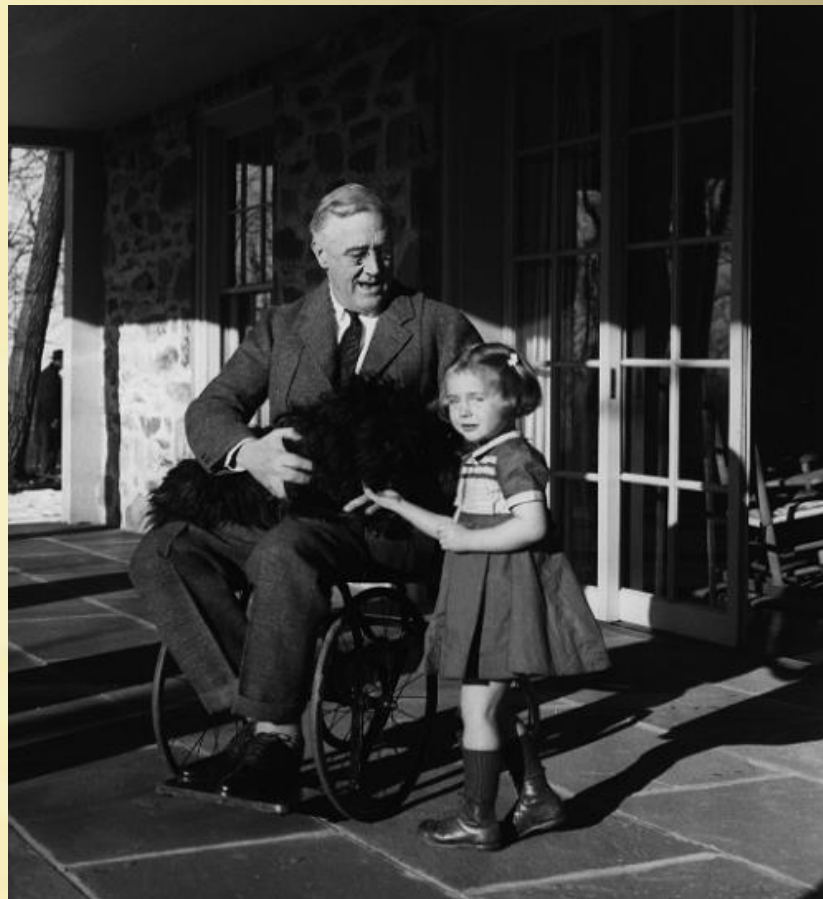
One of only three photos of FDR in a wheelchair, taken in 1941