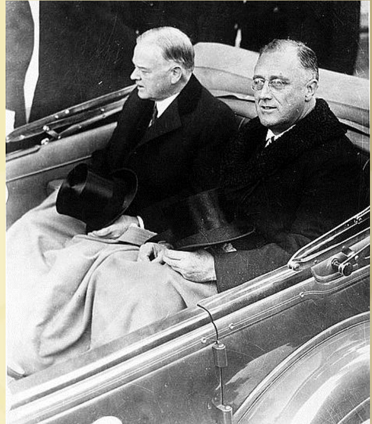
FDR and Herbert Hoover on the way to the inauguration