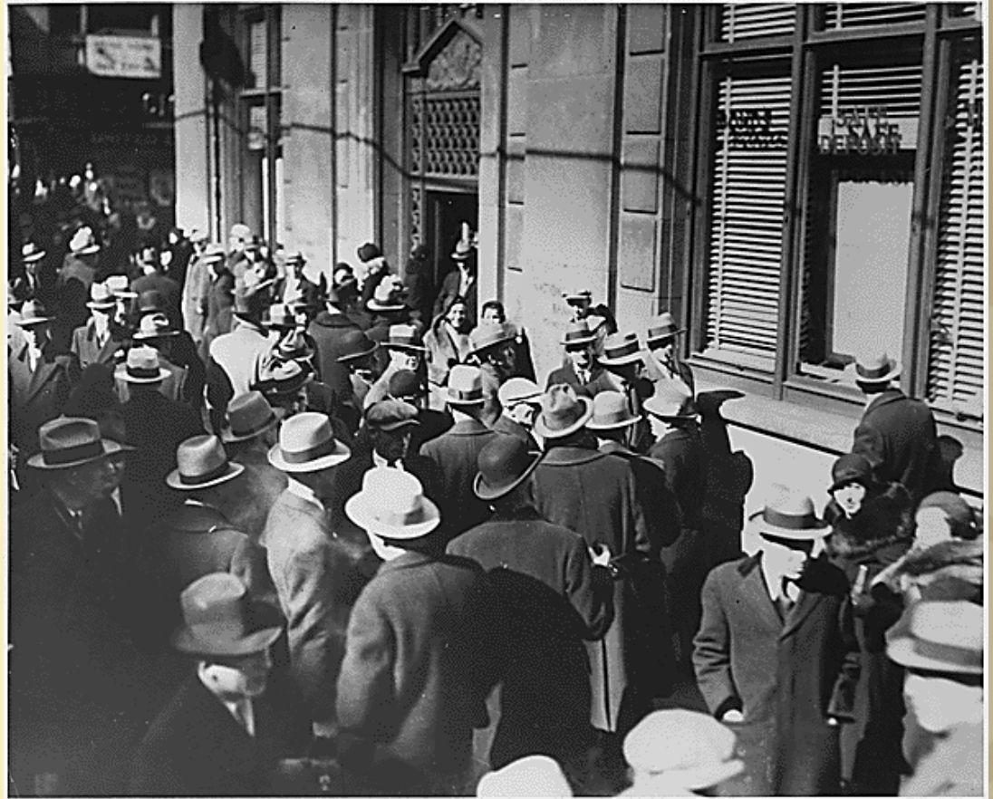
Worried depositors wait outside a bank hoping to withdraw their savings