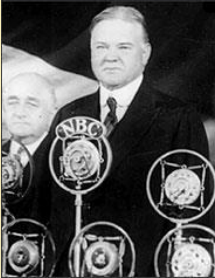
President Herbert Hoover