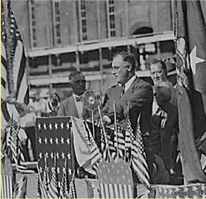
FDR campaigning in 1932