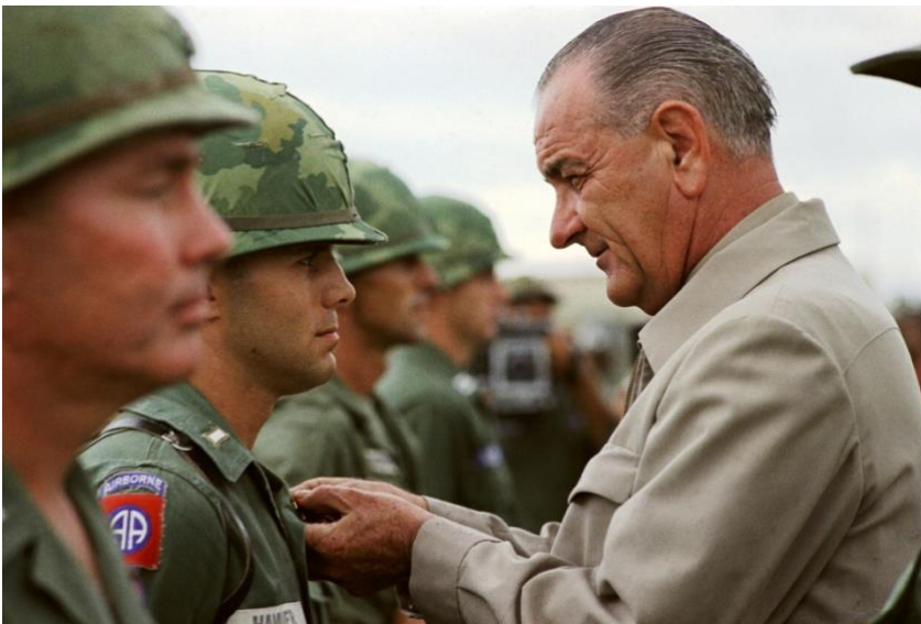
Figure 2: President Lyndon Johnson awards a medal to an American soldier during a visit to Vietnam in 1966.

In 1965, Johnson dramatically escalated US involvement in the war. He authorized a series of bombing campaigns, most notably Operation Rolling Thunder, and also committed hundreds of thousands of US ground troops to the fight. Fearful that the war would jeopardize his domestic agenda, Johnson concealed the extent of the military escalation from the American public.