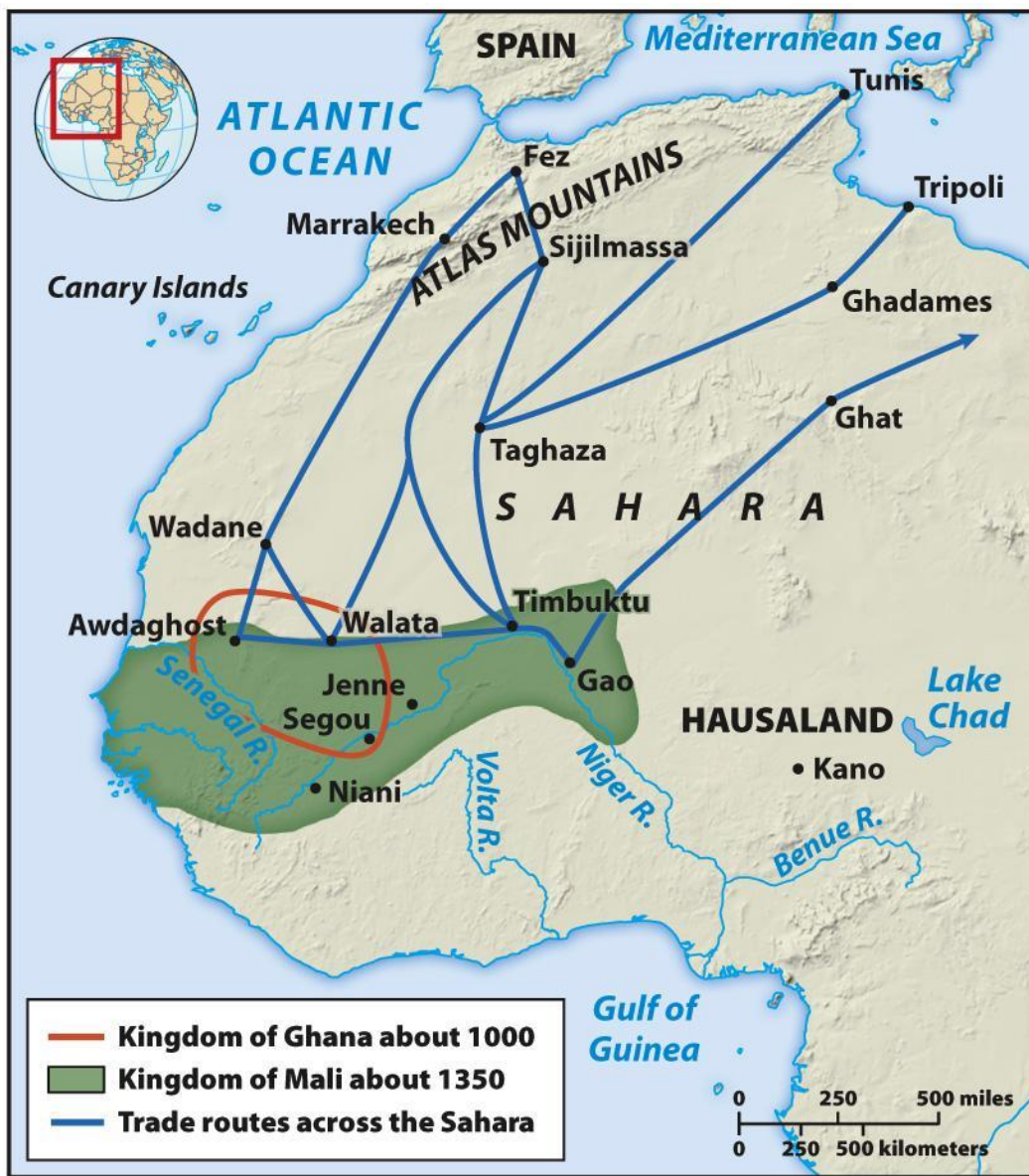
Map 7.4 The Sand Roads Chapter 7, Ways of the World: A Brief Global History with Sources , Third Edition Copyright © 2016 by Bedford/St. Martin's Distributed by Bedford/St. Martin's/Macmillan Higher Education strictly for use with its products; Not for redistribution.