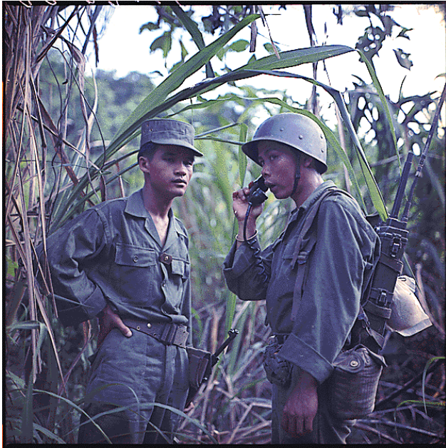
Vietnam. Vietnamese army personnel training in the jungle, May, 1962.

advanced military technology, NVA and VC forces posed significant challenges to the Americans. Neither the VC or the NVA wore bright uniforms marking their enemy status, making it difficult for American soldiers to differentiate between a civilian and a military combatant. And while many of the VC's weapons were crude in comparison to American firepower, as the war progressed Communist forces became increasingly proficient in killing and maiming American forces, using home-made booby traps and mines, mortars, rocket-propelled grenades, and machine guns and anti-aircraft artillery imported from the Soviet Union and China. They repurposed the over 20,000 tons of explosive material dropped by U.S. planes for the homemade bombs. The communists also benefitted from a series of tunnels stretching throughout North and South Vietnam. The tunnels allowed for safe travel; stored ammunition, food, and water; provided sleeping quarters; and hospice for those in need of medical aid. The Communists were also aided by many civilians who provided safe haven, food, and support in local villages across South Vietnam.