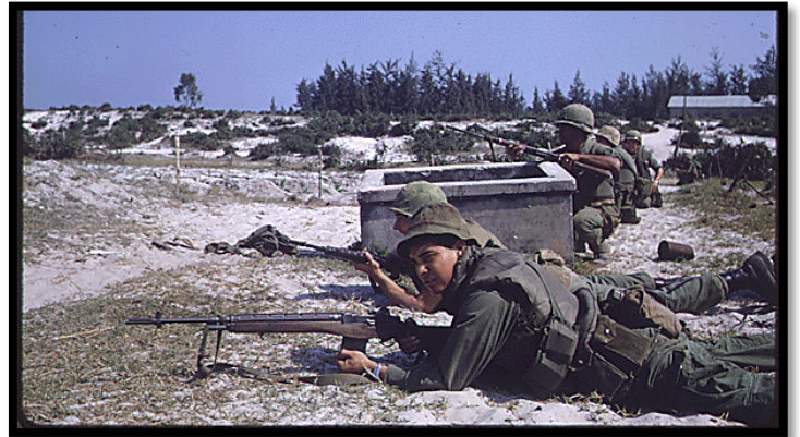
Battle of Hamo Village during Tet, 1968.

On January 30 of the same year, the communists staged their largest military campaign, the Tet Offensive, a surprise attack of nearly all of South Vietnam’s major cities and the U.S. Embassy in 1968. Tet, Lunar New Year, had been traditionally observed as a time of cease-fire for Vietnam’s most important holiday and with the exception of Khe Sanh, American forces had expected a relatively quiet holiday. In a coordinated attack by the Viet Cong and the North Vietnamese forces, American troops were at first surprised, but quickly rallied to push back the communist offensive.