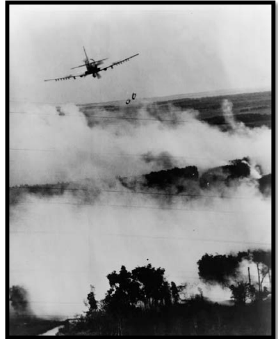
Two bombs tumble from a Vietnamese Air Force A-1E Skyraider over a burning [Viet] Cong hideout near Cantho, South Viet Nam, U.S. Air Force, 1967.

The United States, for example, hoped to defeat North Vietnam through massive bombing campaigns, such as Operation Rolling Thunder . Starting in early 1965, American planes began to drop what would eventually total 4.6 million tons of bombs onto North Vietnam, as well on the Ho Chi Minh Trail, a supply line that the communists used to transport people and goods from the north to the south.