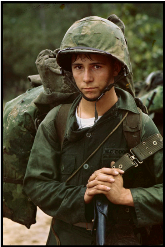
Photograph of a Marine Landing at Danang, Vietnam, 08/03/1965. Source: National Archives, ARC Identifier 595865.

http://www.loc.gov/pictures/item/2001699982/