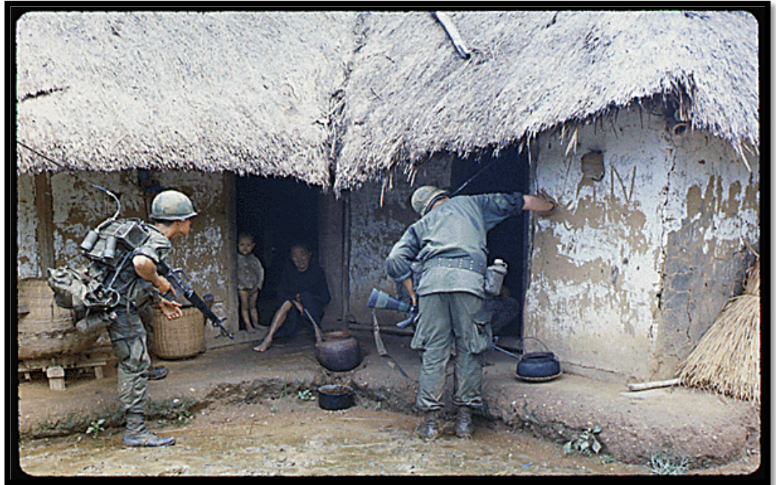
Vietnam. As the second phase of operation "Thayer," the 1st Air Cavalry Division (airmobile) is having operation "Irving" in the area 25 miles north of Qui Nhon which lies 400 miles north-northeast of Saigon. The 1st Air Cavalry was given the mission of clearing a mountain range where an estimated two battalions of North Vietnam regulars were supposed to be massing an attack on Hammond Airstrip. Troops of "A" Company, checking house during patrol, 10/06/1966.

( http://www.history.com/topics/vietnam-war/videos#search-and-destroy ) to hear interviews with Vietnam veterans and archival footage of the war. You will see graphic images of search and destroy missions. As you watch, listen to the soldiers describe the purpose of these missions and the role that they or other soldiers played. What are their perspectives of this war strategy? )