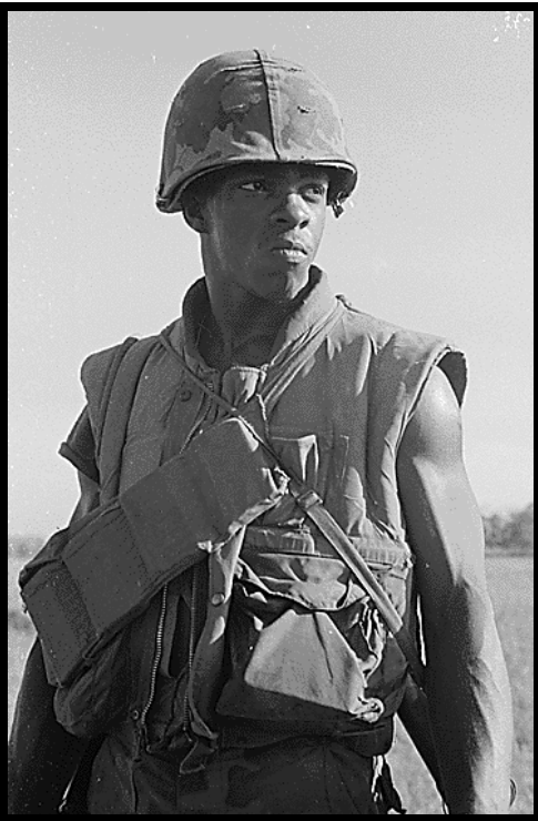
Photograph of Marines of Company I in Vietnam, 10/30/1969.

President Richard Nixon shifted America's military strategy with his election in 1968. Nixon advocated a policy of "Vietnamization," which called for gradual reduction of American forces and increasing military leadership by the South Vietnamese. At the same time, Nixon's Secretary of State began secret peace negotiations with the North Vietnamese in Paris. These negotiations dragged on for years; a peace treaty between the U.S. and North Vietnam wasn't signed until 1973. In the interim period, the fighting continued and Nixon launched a controversial bombing campaign in Cambodia designed to destroy the supply bases supporting the communist forces. Public support for American involvement in the conflict declined precipitously during the period as well, increasing pressure on the Nixon Administration to end the war. Following the American departure from the war in 1973, South Vietnamese forces continued to fight until they were overrun in 1975 with the fall of Saigon.