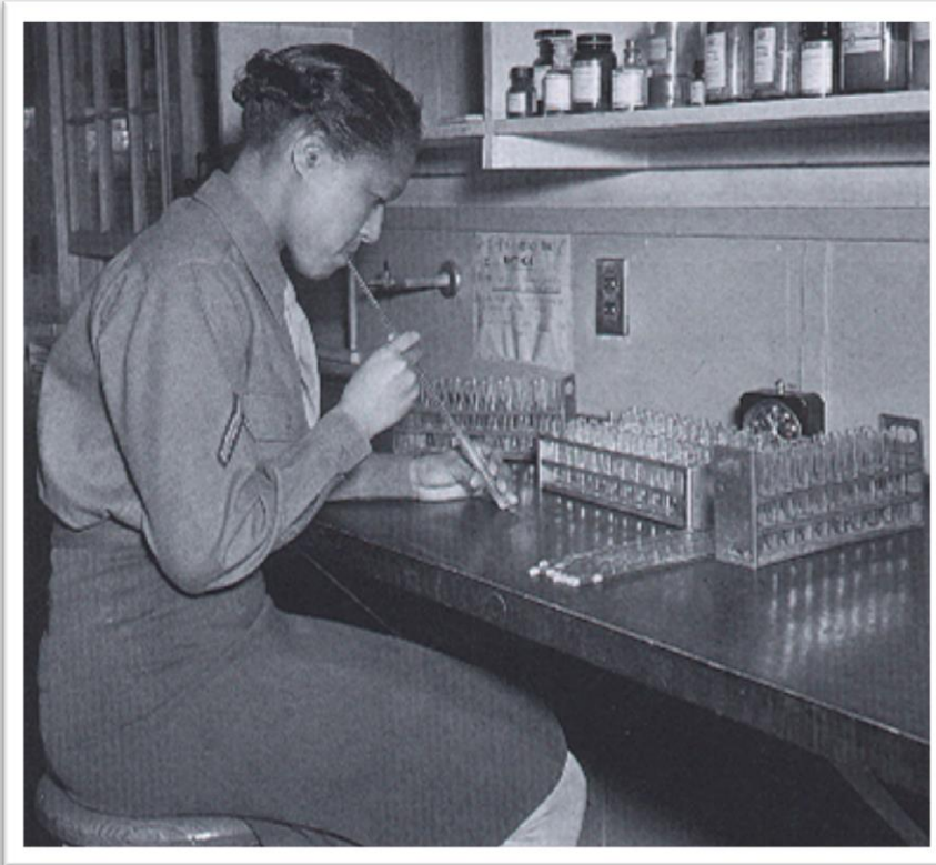
Women's Auxiliary Corps laboratory technician conducts an experiment, Fort Jackson State Hospital, 1944