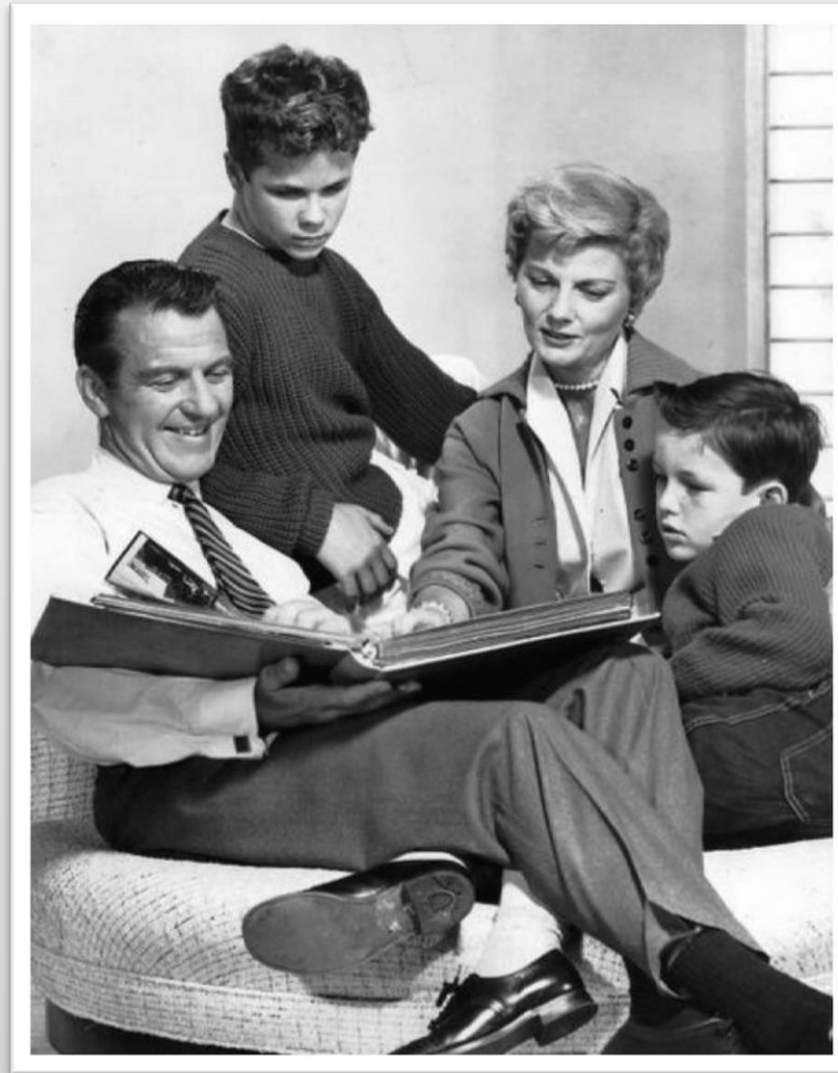
A photo of the Cleaver family from Leave it to Beaver , a popular TV show in the 1950s-60s