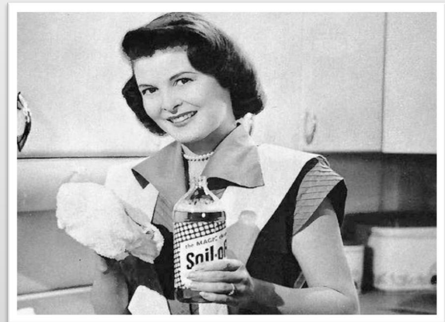
A 1950s ad for a cleaning product