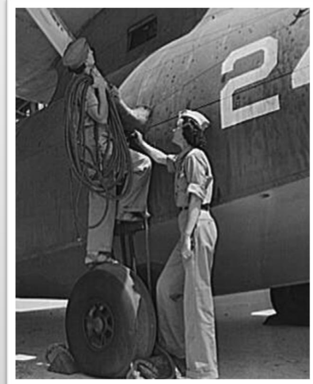
Aircraft engine technician and senior supervisor, Naval Air Base, 1942