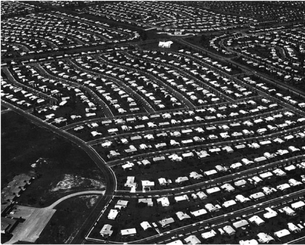
Levittown track homes of the 1950s