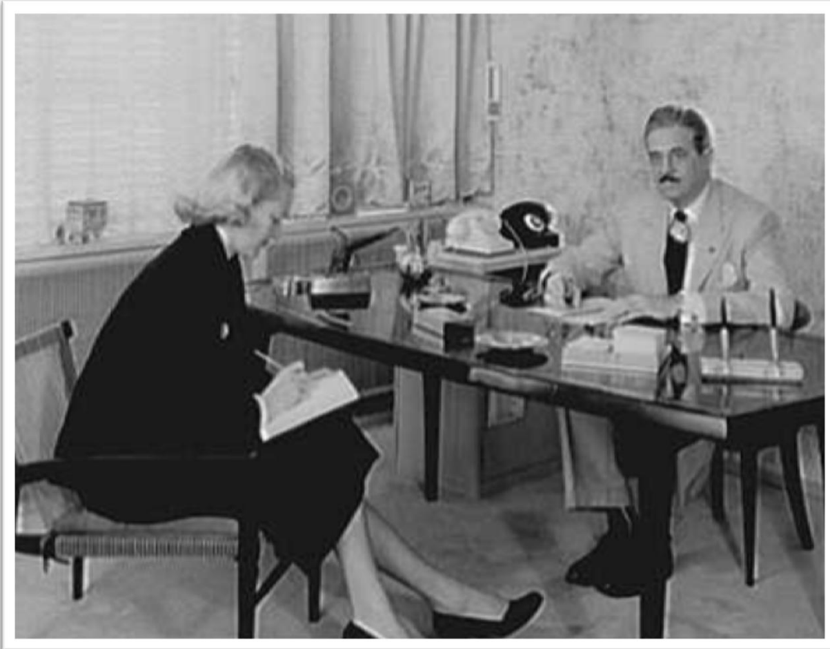
A secretary and her boss, an industrial designer, New York City, 1950