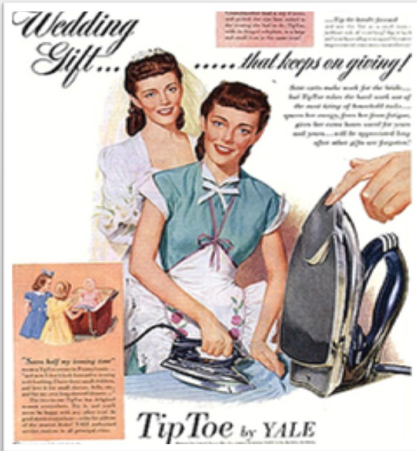
A 1950s ad for an electric iron